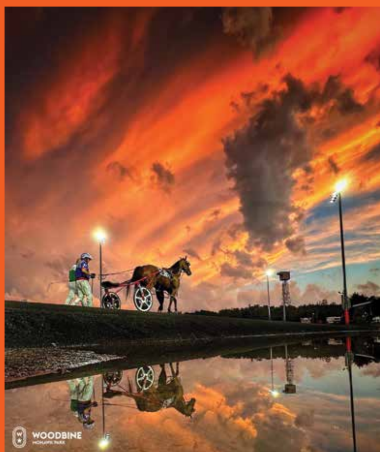
WOODBINE HORSE RACING