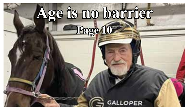
Age is no barrier Page 10