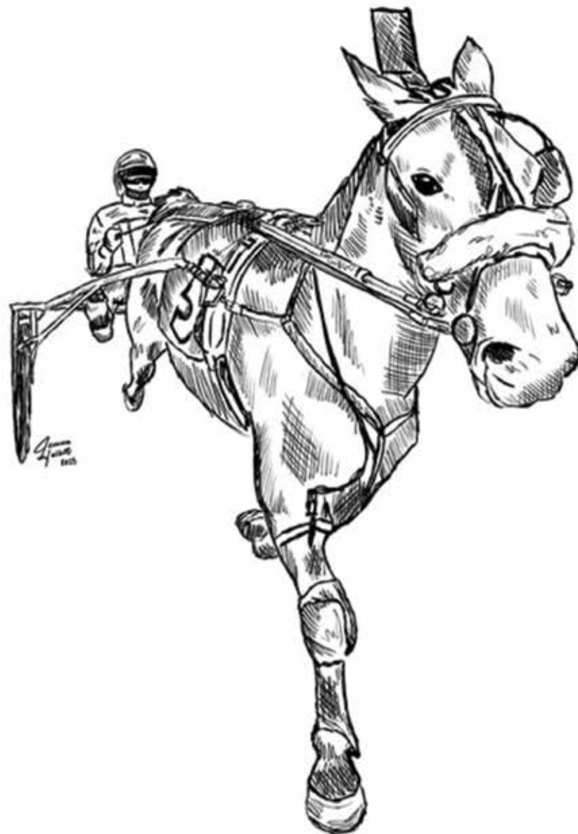
Another example of the drawing skill of Jessica Hallett