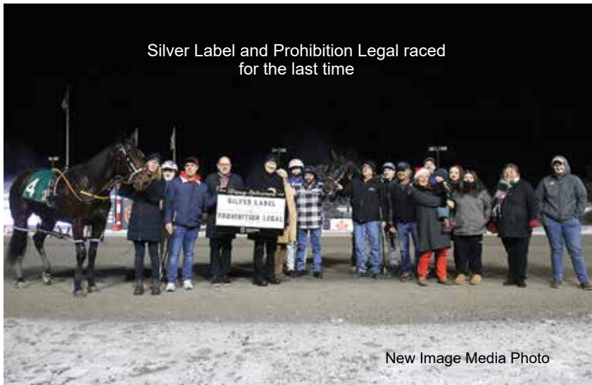
Silver Label and Prohibition Legal raced for the last time

A pair of award-winning 5-year-old mares, both owned by Millar Farms, were celebrated at Mohawk Park on Saturday, December 21 as both concluded their careers. Silver Label and Prohibition Legal both raced for the last time, and as they had done multiple times before, they competed in the same race. This time it was a