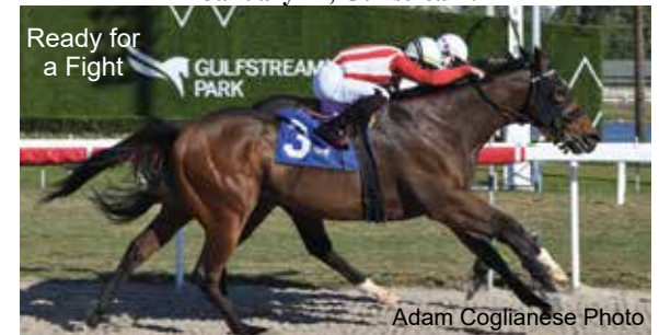
Ready for a Fight