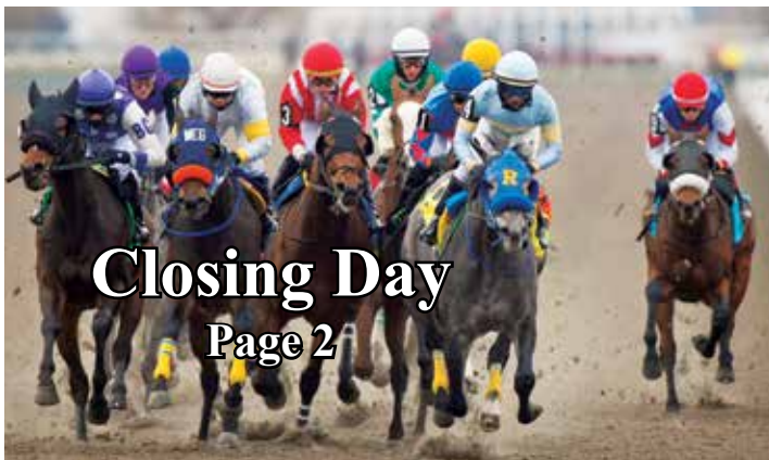
Closing Day Page 2