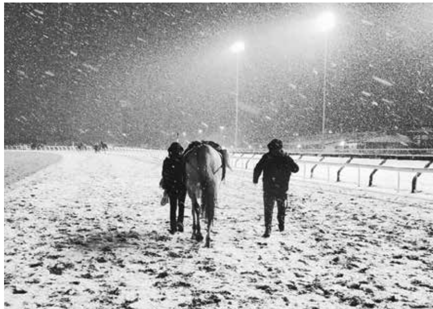
Photographer Will Wong took this shot on a snowy December afternoon at Woodbine