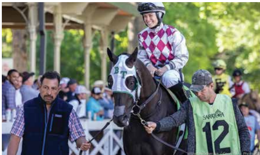
Being Underestimated is one of the Biggest Competitive Advantages you can have. Embrace it ❤️